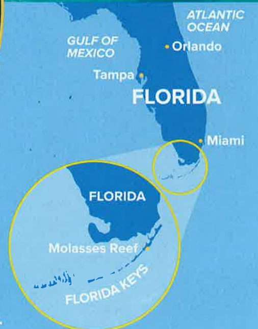
MAP: The underwater nursery is on Molasses Reef in the Florida Keys.